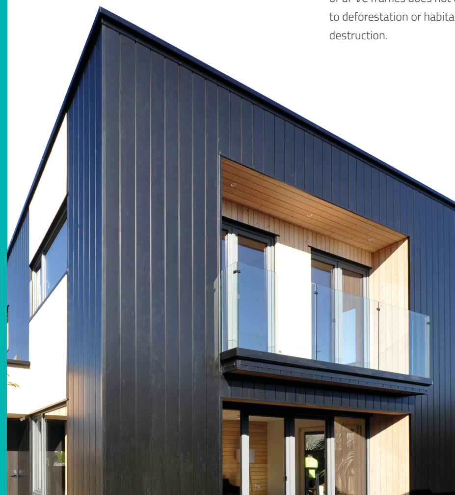
New Zealand's first 10 Homestar™ rated home.