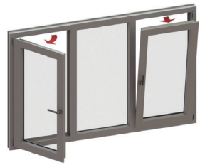
Inwards Tilt and Turn

We offer four main window types; Fixed Windows, Tilt and Turn Windows, Awning Windows and Casement Windows. Our windows can be customised to suit your house design and style. For renovation projects we can either match existing window styles, or many clients take the opportunity to re-think their window configurations. For new projects there is the opportunity for us to be involved early in the design process to ensure you get maximum benefits from the flexibility uPVC window systems offer.