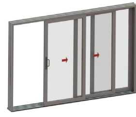
Multi Slide (Stacker)